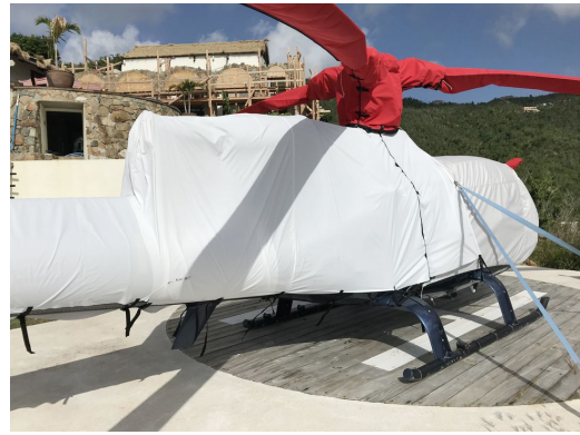
Aerospatiale AS341/342 Gazelle Full Cover Set