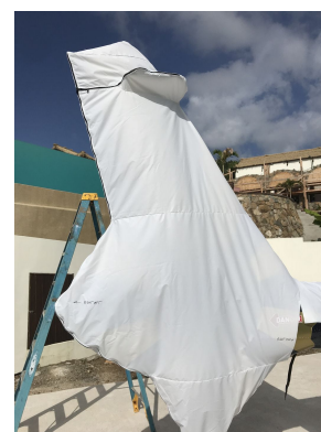
Aerospatiale Gazelle AS341 Tailfan Housing Extended Cover (test fit cover)