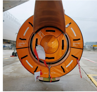
Airbus A320 Exhaust & Bypass Vent Plugs