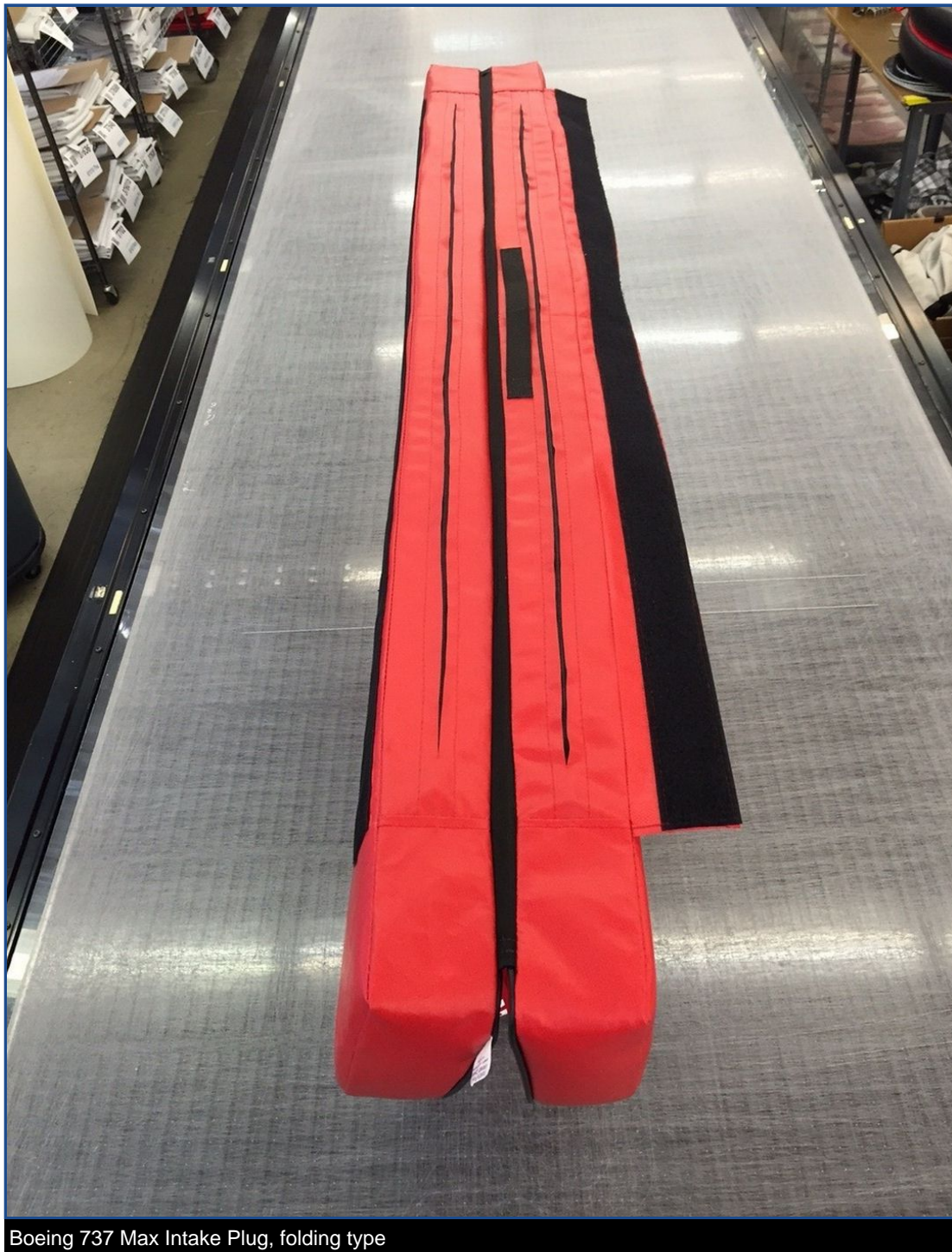
Boeing 737 Max Intake Plug, folding type