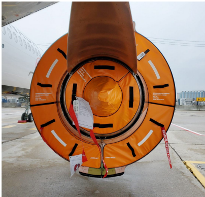
Airbus A320 Exhaust & Bypass Vent Plugs

The Engine Inlet Plugs are custom fit for your Airbus A320 intakes, made with heavy-duty vinyl material, and stuffed with a single block of sculpted urethane foam. Each plug has a zipper that allows the foam to be removed and dried if necessary. Engine plugs have 'remove before flight' streamers sewn onto the face of the plugs. Most plugs are imprinted with the aircraft registration number in black for an extra charge. Storage bag NOT included. Engine plugs may be inserted after flight when the engine is still warm. Engine Inlet Plugs are commonly referred to as Cowl Plugs, Intake Plugs, Cowl Blocks, Engine Blocks, and Engine Bungs.