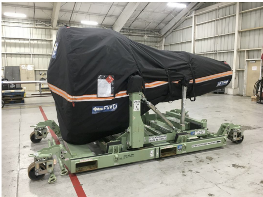
CFM56-5B Off Link Cover, fully enclosed