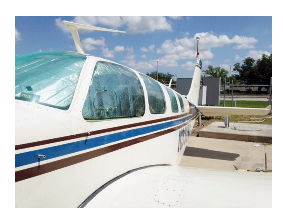
Beech Bonanza HeatShields

Windshield Heatshields are interior sunshades for an aircraft's front windshield. The product is a unique composite of closed-cell foam with a silver mylar finish. The semi-rigid design is stiff enough to stand along the inside of the windshield using sun visors or window framing. It folds up flat and easily stores in the included storage sleeve. Some designs may require velcro and suction cups or split right and left sides. A Heatshield is an excellent short-term remedy for cockpit overheating. An external fabric cover is far more effective and practical for long-term protection.