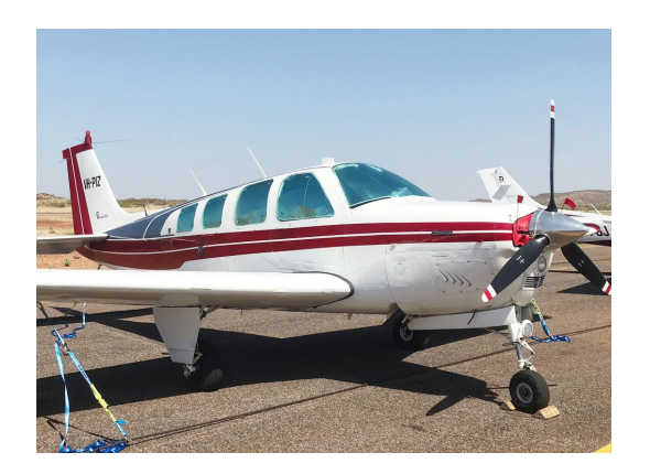
Beech A-36 Bonanza Cabin HeatShields