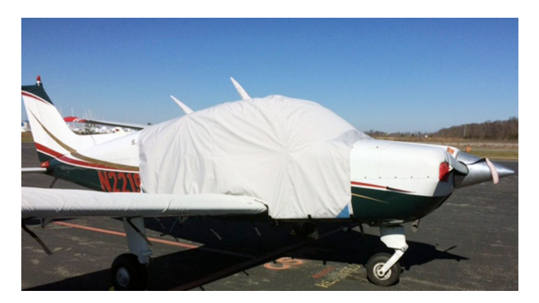
Beech Sundowner Extended Canopy Cover, Belly Strap Type