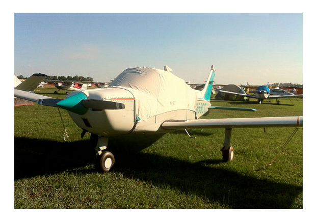
Beech C23 Sundowner Canopy Cover

Travel Covers are made with Silver Solution-Dyed Polyester fabric and only lined over the windshield to save weight. The material is lightweight and more compact for easy stowage in the aircraft. The polyester material is water resistant, but only intended for occasional use outside. We also have an ultra lightweight material available for fitted hangar dust covers. For daily outdoor use, the non-travel Sunbrella Cover is the best choice.