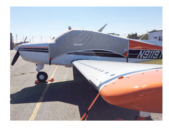
Beech Musketeer Canopy Cover

This cover type is made from Silver Acrylic Sunbrella canvas and is 100% lined with a soft and smooth microfiber. Bruce's Custom Covers developed this material combination especially for aircraft protection. The outer material is medium weight and treated for water resistance, UV resistance and anti-static buildup. The inner lining is a very soft and smooth microfiber to prevent scratching. The material is very reflective, and tests show that the cabin interior temperature can be reduced to near-ambient temperature on the hottest of days. It is water, ice and snow repellent, yet breathable to allow moisture to escape from between the cover and the aircraft surface.