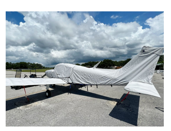
Beech Musketeer A23 Cover Set