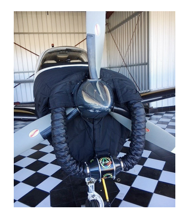
Beech Bonanza 36 Models Insulated Engine Cover

This cover type is made from Silver Acrylic Sunbrella canvas and is 100% lined with a soft and smooth microfiber. Bruce's Custom Covers developed this material combination especially for aircraft protection. The outer material is medium weight and treated for water resistance, UV resistance and anti-static buildup. The inner lining is a very soft and smooth microfiber to prevent scratching. The material is very reflective, and tests show that the cabin interior temperature can be reduced to near-ambient temperature on the hottest of days. It is water, ice and snow repellent, yet breathable to allow moisture to escape from between the cover and the aircraft surface.