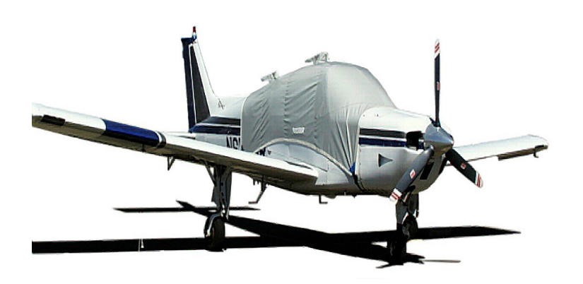
Beech Sport Canopy Cover