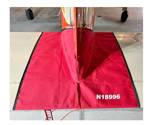
Beech C24R Tailcone Cover, Fully Enclosed

WINTER USE MATERIAL - Made with Solution-Dyed Polyester fabric, this option is intended for seasonal use to aid in deicing, rain mitigation, or for occasional travel. The material is lighter and more compact, but more susceptible to UV damage and may have a shorter useful life if used continuously outside than the all-year use material.