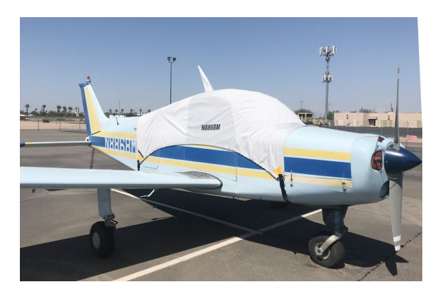
Beech Musketeer Canopy Cover