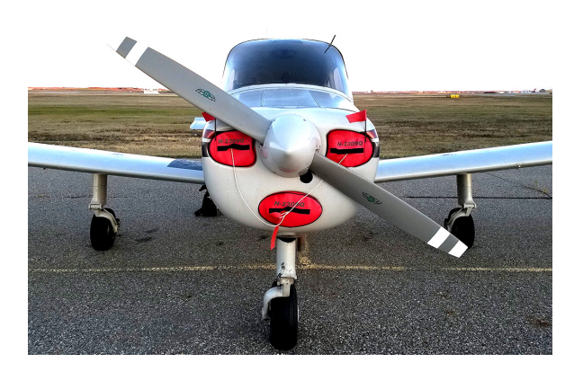
Beech Musketeer Engine Inlet Plugs