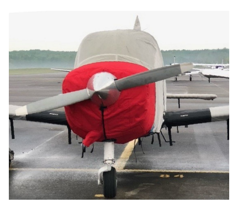
Beech Sierra Insulated Engine Cover