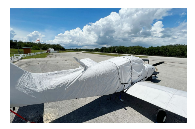
Beech Musketeer A23 Cover Set

WINTER USE MATERIAL - Made with Solution-Dyed Polyester fabric, this option is intended for seasonal use to aid in deicing, rain mitigation, or for occasional travel. The material is lighter and more compact, but more susceptible to UV damage and may have a shorter useful life if used continuously outside than the all-year use material.