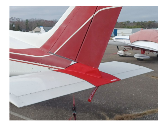
Beech C23 Sundowner Tailcone Cover, fully enclosed