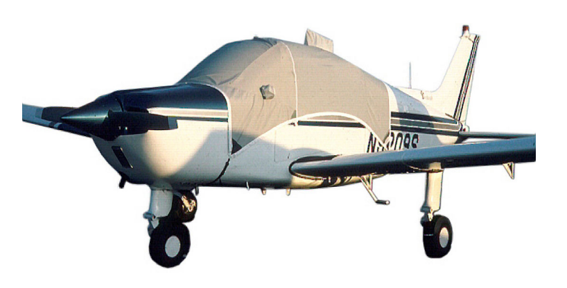
Beech Sport Canopy Cover

Travel Covers are made with Silver Solution-Dyed Polyester fabric and only lined over the windshield to save weight. The material is lightweight and more compact for easy stowage in the aircraft. The polyester material is water resistant, but only intended for occasional use outside. We also have an ultra lightweight material available for fitted hangar dust covers. For daily outdoor use, the non-travel Sunbrella Cover is the best choice.