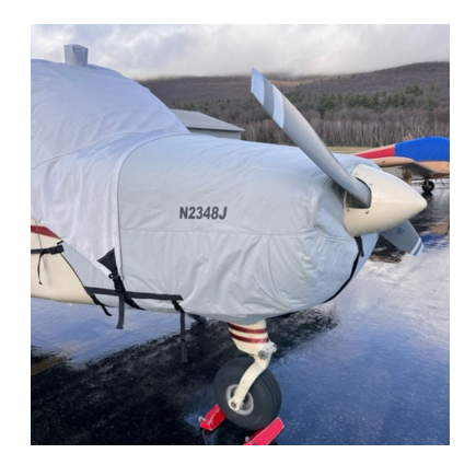
Beech Musketeer Insulated Engine Cover

This cover type is made from Silver Acrylic Sunbrella canvas and is 100% lined with a soft and smooth microfiber. Bruce's Custom Covers developed this material combination especially for aircraft protection. The outer material is medium weight and treated for water resistance, UV resistance and anti-static buildup. The inner lining is a very soft and smooth microfiber to prevent scratching. The material is very reflective, and tests show that the cabin interior temperature can be reduced to near-ambient temperature on the hottest of days. It is water, ice and snow repellent, yet breathable to allow moisture to escape from between the cover and the aircraft surface.