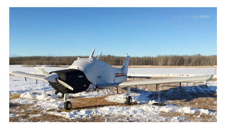
Beech Sport Insulated Engine Cover & Winter Cover Set

This cover type is made from Silver Acrylic Sunbrella canvas and is 100% lined with a soft and smooth microfiber. Bruce's Custom Covers developed this material combination especially for aircraft protection. The outer material is medium weight and treated for water resistance, UV resistance and anti-static buildup. The inner lining is a very soft and smooth microfiber to prevent scratching. The material is very reflective, and tests show that the cabin interior temperature can be reduced to near-ambient temperature on the hottest of days. It is water, ice and snow repellent, yet breathable to allow moisture to escape from between the cover and the aircraft surface.