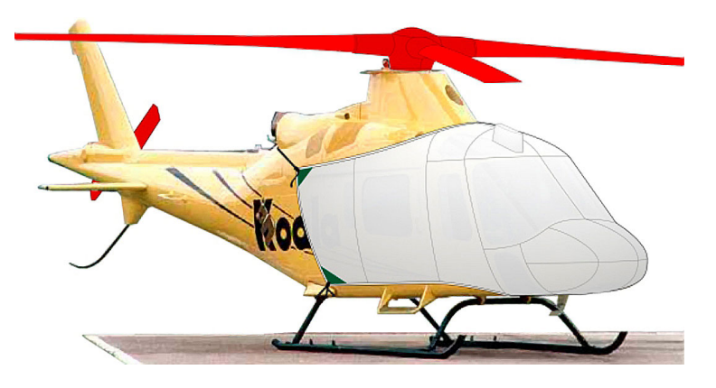
Koala Bubble, Rotor Hub, Blade & Tail Rotor Covers (illustration)