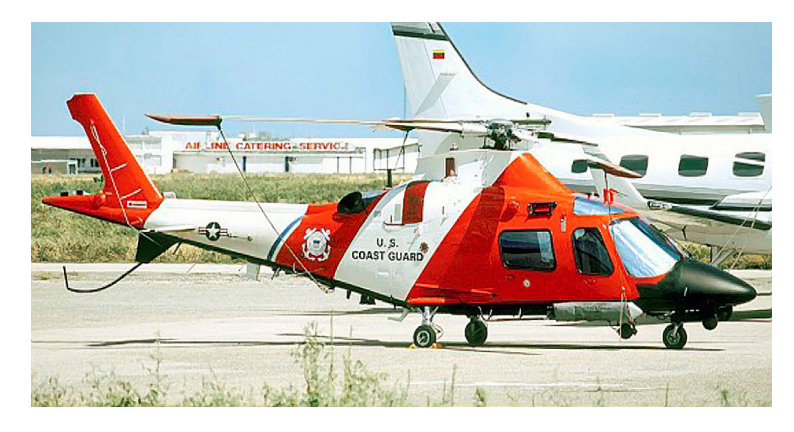
Covers, Plugs, HeatShields and related items for the Agusta MH-68A

Cockpit Heatshields are interior sunshades for the aircraft's cockpit. The product is a unique composite of closed-cell foam with a silver mylar finish. The semi-rigid design is stiff enough to stand inside the window framing. Darts and folds are incorporated into the material so that it conforms to the complex shape of the helicopter windows. The set folds up flat and is easily stored in the included storage sleeve. Some designs may require velcro and suction cups. A Heatshield is an excellent short-term remedy for cockpit overheating, but an external fabric cover is more effective for long-term protection.