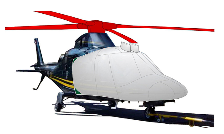
Agusta Leonardo A169 Bubble Cover with Wire Strike, 3D model