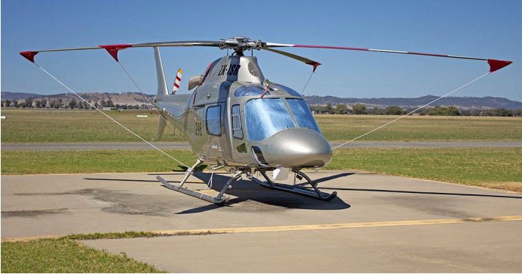
Agusta 119 Cockpit/Cabin HeatShields