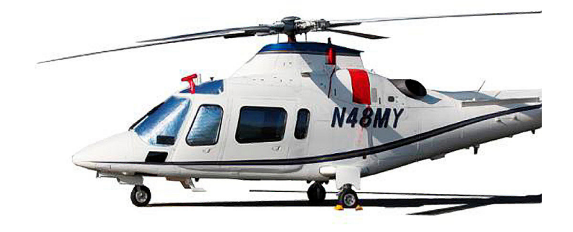
Agusta AW109 (A, C, & Trekker) Pitot Cover Set