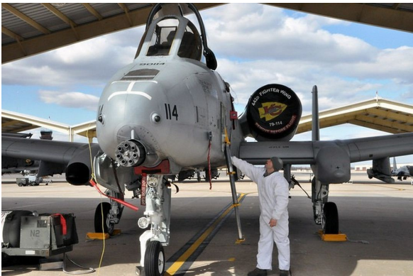
Fairchild A10 Intake Covers & Nose Gun Scoop Plug