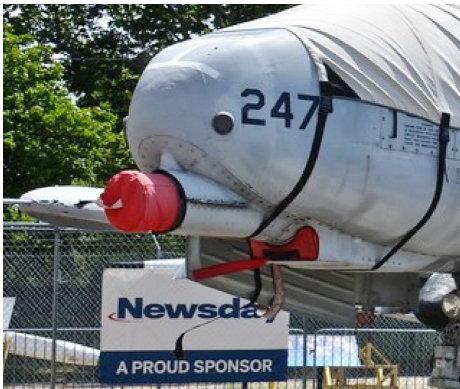
Fairchild A10 Thunderbolt Nose Gun Cover, Gun Scoop Inlet Plug

The Engine Inlet Plugs are custom fit for your Fairchild A10 Thunderbolt intakes, made with heavy-duty vinyl material, and stuffed with a single block of sculpted urethane foam. Each plug has a zipper that allows the foam to be removed and dried if necessary. Engine plugs have 'remove before flight' streamers sewn onto the face of the plugs. Most plugs are imprinted with the aircraft registration number in black for an extra charge. Storage bag NOT included. Engine plugs may be inserted after flight when the engine is still warm. Engine Inlet Plugs are commonly referred to as Cowl Plugs, Intake Plugs, Cowl Blocks, Engine Blocks, and Engine Bungs.