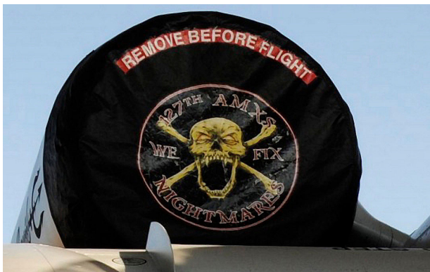
A-10 Engine Covers with Custom Artwork

ALL-YEAR USE MATERIAL - Made with Solution dyed Polyester fabric, the all-year use material is the best option for sun protection and cover longevity. This heavier more durable material is intended for all weather conditions, such as rain and snow or lots of sun.