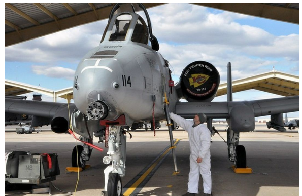
Fairchild A10 Intake Covers & Nose Gun Scoop Plug