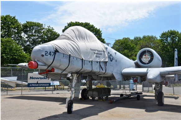
Fairchild A10 Thunderbolt Nose Gun Cover, Gun Scoop Inlet Plug Fairchild A10 Thunderbolt Canopy Cover, Nose Gun Cover, Gun Scoop Inlet Plug