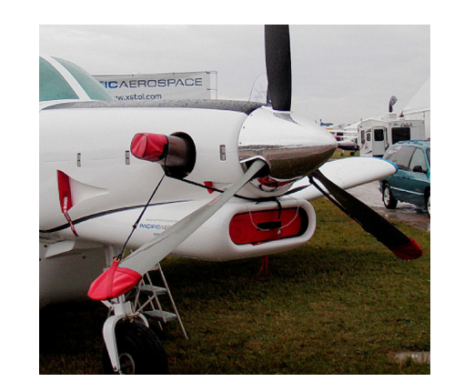
750XL Engine Inlet Plugs & Prop Tie/Exhaust Covers