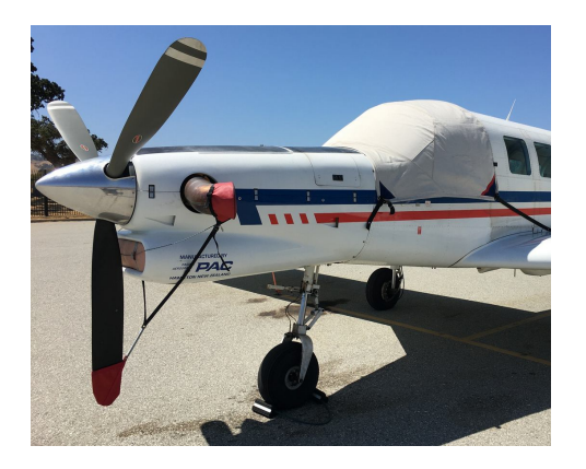
Pacific Aerospace 750XL Cockpit Cover, Prop Tie/Exhaust Covers

The material is very reflective, and tests show that the cabin interior temperature can be reduced to near-ambient temperature on the hottest of days. It is water, ice and snow repellent, yet breathable to allow moisture to escape from between the cover and the aircraft surface.