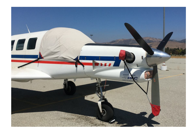
Pacific Aerospace 750XL Cockpit Cover, Prop Tie/Exhaust Covers