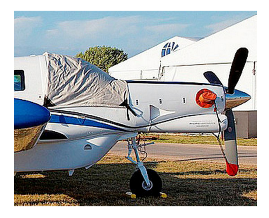
750XL Cockpit Cover & Prop Tie/Exhaust Covers

This cover type is made from Silver Acrylic Sunbrella canvas and is 100% lined with a soft and smooth microfiber. Bruce's Custom Covers developed this material combination especially for aircraft protection. The outer material is medium weight and treated for water resistance, UV resistance and anti-static buildup. The inner lining is a very soft and smooth microfiber to prevent scratching. The material is very reflective, and tests show that the cabin interior temperature can be reduced to near-ambient temperature on the hottest of days. It is water, ice and snow repellent, yet breathable to allow moisture to escape from between the cover and the aircraft surface.