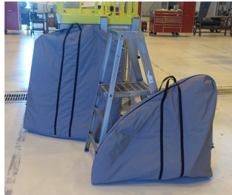
Eurocopter EC-145 Padded Bags for Removable Doors