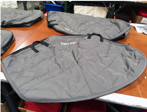
Protective Door Bags

**Padded Door Bags* are designed to provide portable protection of the doors when they are removed from the aircraft. They are padded to moderate thickness, zippered closed, and have sturdy carry handles for easy transport.