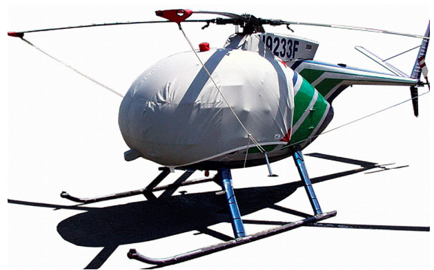
Hughes 500C Bubble Cover with Intake Add-on, Blade Tie-downs