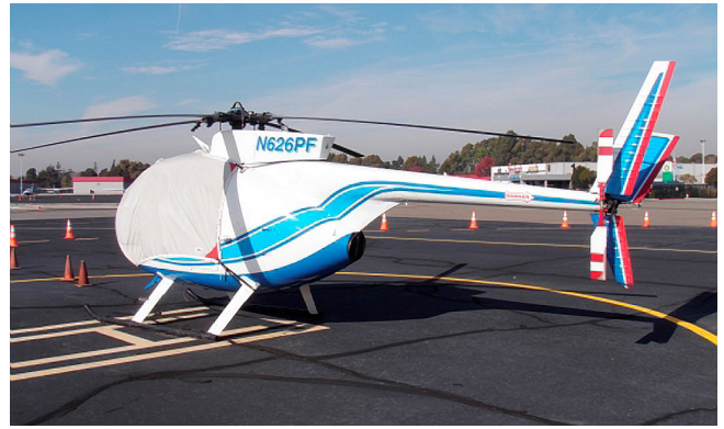
MD500C Bubble Cover with Wire Strike detail