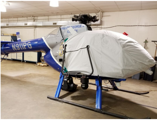
McDonnell Douglas MDD 520 Notar Bubble Cover, with special missions equipment.