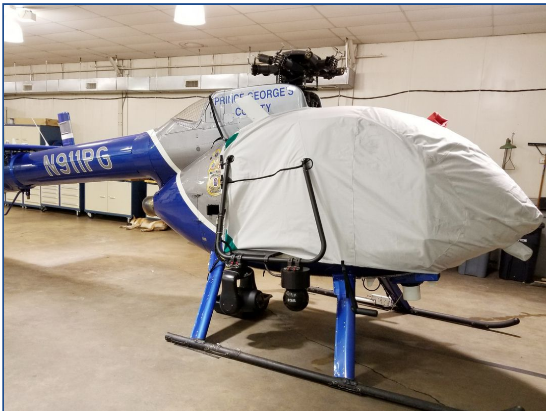
McDonnell Douglas MDD 520 Notar Bubble Cover, with special missions equipment.