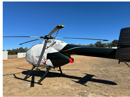
MDD 520 NOTAR Bubble Cover w/Intake Cover Add-On, Exhaust Cover