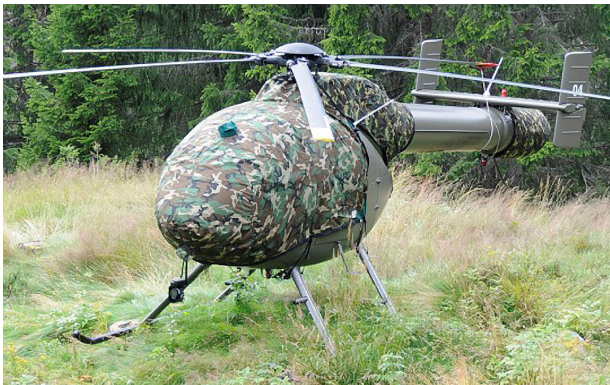
MD520 NOTAR Bubble, Engine, & NOTAR Covers & Blade Tie-downs

The Tailboom Cover details vary by model, but generally the helicopter tail boom cover encloses the tail boom from the "bottleneck" to the aft end. They usually also cover the horizontal stabilizers, and are custom made to allow for antennae, lights, and other protrusions. They attach with straps underneath the tail boom. Covers for the vertical and horizontal stabilizers are also available separately. Specific information for each model is available on request.