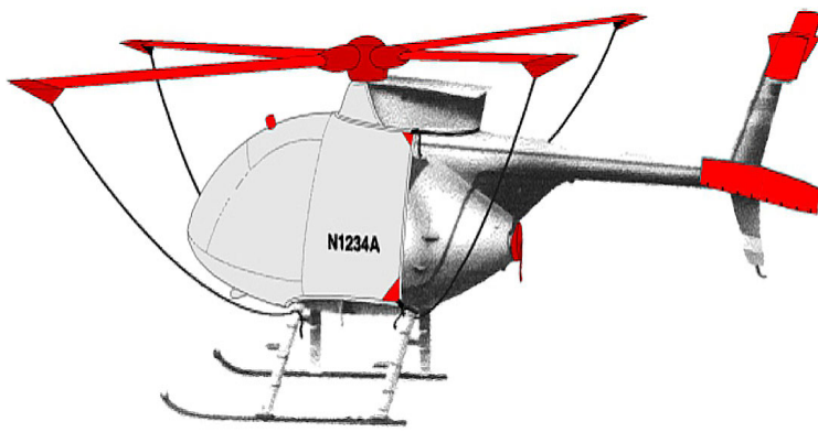
Full Cover Set