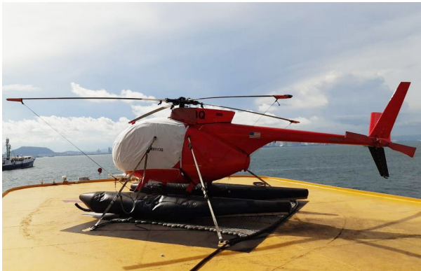
Hughes 500C (369HS) Bubble Cover, Blade Tie-Downs

WINTER USE MATERIAL - Made with Solution-Dyed Polyester fabric, this option is intended for seasonal use to aid in deicing, rain mitigation, or for occasional travel. The material is lighter and more compact, but more susceptible to UV damage and may have a shorter useful life if used continuously outside than the all-year use material.