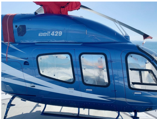
Bell 429 Cockpit & Cabin HeatShields

Cockpit Heatshields are interior sunshades for the aircraft's cockpit. The product is a unique composite of closed-cell foam with a silver mylar finish. The semi-rigid design is stiff enough to stand inside the window framing. Darts and folds are incorporated into the material so that it conforms to the complex shape of the helicopter windows. The set folds up flat and is easily stored in the included storage sleeve. Some designs may require velcro and suction cups. A Heatshield is an excellent short-term remedy for cockpit overheating, but an external fabric cover is more effective for long-term protection.