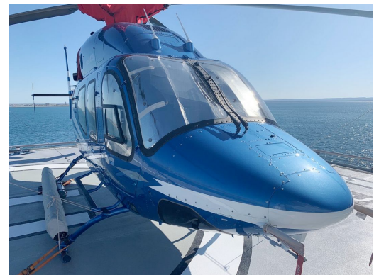
Bell 429 Cockpit HeatShields