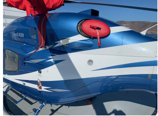
Bell 429 Exhaust Plug