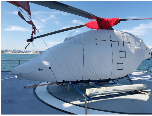
Bell 429 Main Body Cover