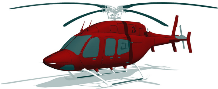
Bell 429 Insulated Tail Rotor Cover

WINTER USE MATERIAL - Made with Solution-Dyed Polyester fabric, this option is intended for seasonal use to aid in deicing, rain mitigation, or for occasional travel. The material is lighter and more compact, but more susceptible to UV damage and may have a shorter useful life if used continuously outside than the all-year use material.