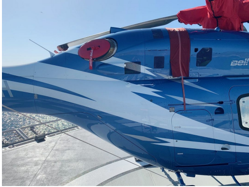
Bell 429 Exhaust Plug, Rotor Mast Cover

The Engine Exhaust Plugs are custom fit for your Bell 429 exhaust openings, made with heavy-duty vinyl material, and stuffed with a single block of sculpted urethane foam. Exhaust plugs have 'Remove Before Flight' streamers sewn onto the face of the plugs. Exhaust plugs may be inserted soon after flight when the engine is still warm. Engine Inlet Plugs are commonly referred to as Cowl Plugs, Intake Plugs, Cowl Blocks, Engine Blocks, and Engine Bungs.