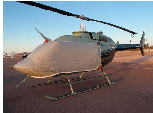
Bell 206L Longranger Bubble Cover