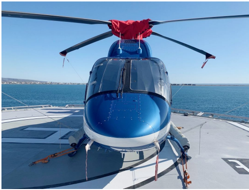
Bell 429 Windshield HeatShields, Rotor Mast Cover

Cockpit Heatshields are interior sunshades for the aircraft's cockpit. The product is a unique composite of closed-cell foam with a silver mylar finish. The semi-rigid design is stiff enough to stand inside the window framing. Darts and folds are incorporated into the material so that it conforms to the complex shape of the helicopter windows. The set folds up flat and is easily stored in the included storage sleeve. Some designs may require velcro and suction cups. A Heatshield is an excellent short-term remedy for cockpit overheating, but an external fabric cover is more effective for long-term protection.