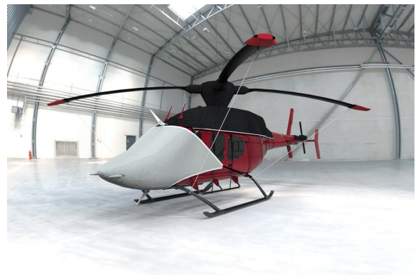
Bell 429 Cockpit/Nose Cover, Engine Cover, etc.