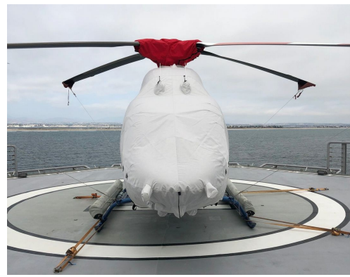
Bell 429 Main Body Cover, Rotor Hub & Tail Rotor Covers