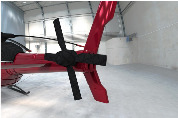
Bell 429 Tail Rotor Cover