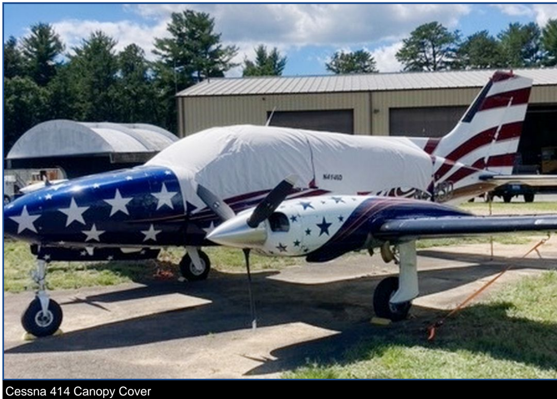
Cessna 414 Canopy Cover