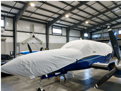
Cessna 421B Canopy/Nose Cover

This cover type is made from Silver Acrylic Sunbrella canvas and is 100% lined with a soft and smooth microfiber. Bruce's Custom Covers developed this material combination especially for aircraft protection. The outer material is medium weight and treated for water resistance, UV resistance and anti-static buildup. The inner lining is a very soft and smooth microfiber to prevent scratching. The material is very reflective, and tests show that the cabin interior temperature can be reduced to near-ambient temperature on the hottest of days. It is water, ice and snow repellent, yet breathable to allow moisture to escape from between the cover and the aircraft surface.