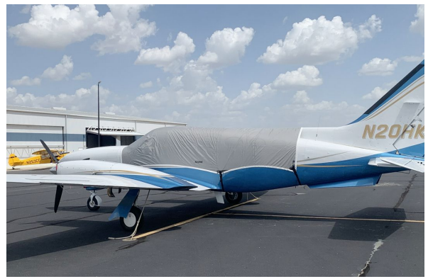
Cessna 414 Travel Weight Canopy Cover