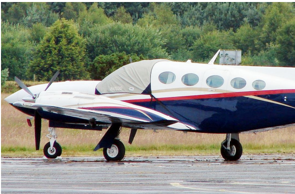
Cessna 421 Cockpit Cover