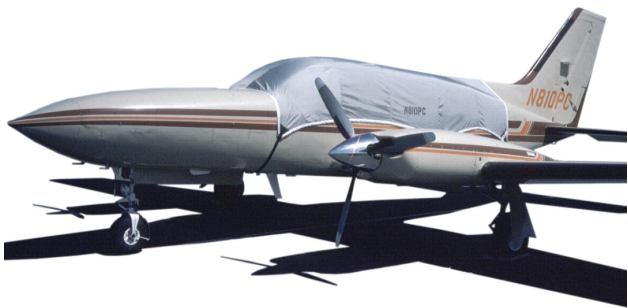
Cessna 421 Cockpit/Windshield Cover