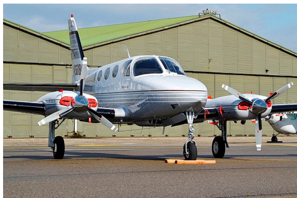
Cessna 340 Engine Plugs

Engine Inlet Plugs are custom fit for your Cessna 404 Titan, F406 Caravan II intakes, made with heavy-duty vinyl material, and stuffed with a single block of sculpted urethane foam. Each plug has a zipper that allows the foam to be removed and dried if necessary. Engine plugs have warning flags that are visible from the cockpit or 'remove before flight' streamers sewn onto the face of the plugs. Most plugs are imprinted with the aircraft registration number in black for an extra charge. Storage bag NOT included. Engine plugs may be inserted after flight when the engine is still warm. Engine Inlet Plugs are commonly referred to as Cowl Plugs, Intake Plugs, Cowl Blocks, Engine Blocks, and Engine Bungs.