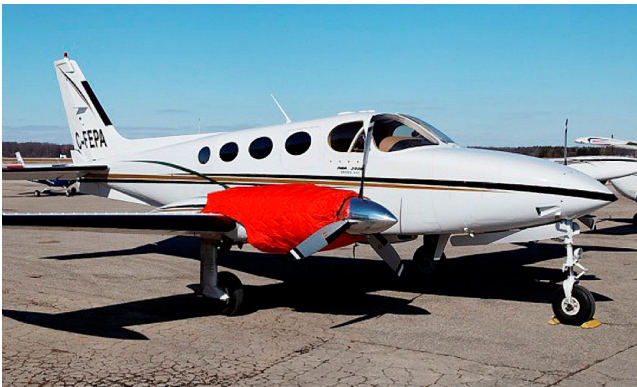
Cessna 340 Insulated Engine Covers

This cover type is made from Silver Acrylic Sunbrella canvas and is 100% lined with a soft and smooth microfiber. Bruce's Custom Covers developed this material combination especially for aircraft protection. The outer material is medium weight and treated for water resistance, UV resistance and anti-static buildup. The inner lining is a very soft and smooth microfiber to prevent scratching. The material is very reflective, and tests show that the cabin interior temperature can be reduced to near-ambient temperature on the hottest of days. It is water, ice and snow repellent, yet breathable to allow moisture to escape from between the cover and the aircraft surface.