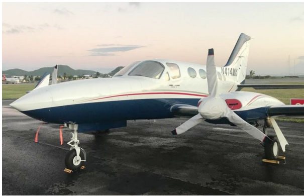
Cessna 414 Propellor/Spinner Covers, 3 Blade