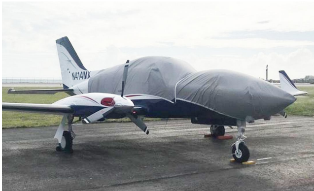
Cessna 414 Travel Cover, Light Weight Canopy Cover

non-travel Sunbrella Cover is the best choice.