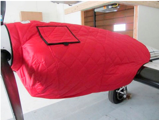
Cessna 421 Insulated Engine Covers

This cover type is made from Silver Acrylic Sunbrella canvas and is 100% lined with a soft and smooth microfiber. Bruce's Custom Covers developed this material combination especially for aircraft protection. The outer material is medium weight and treated for water resistance, UV resistance and anti-static buildup. The inner lining is a very soft and smooth microfiber to prevent scratching. The material is very reflective, and tests show that the cabin interior temperature can be reduced to near-ambient temperature on the hottest of days. It is water, ice and snow repellent, yet breathable to allow moisture to escape from between the cover and the aircraft surface.