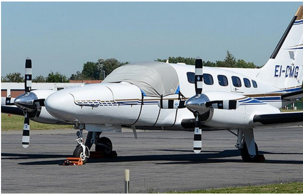
Cessna 441 Cockpit Cover