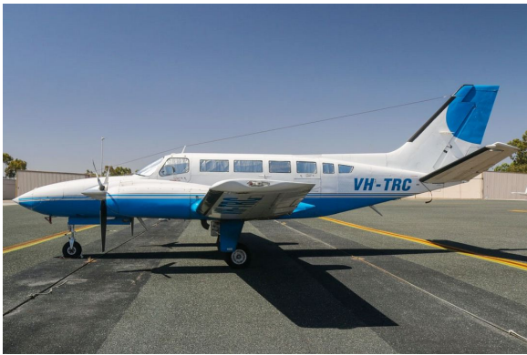
Cessna 404 & F406 HeatShields

window framing. It folds up flat and easily stores in the included storage sleeve. Some designs may require velcro and suction cups. A Heatshield is an excellent short-term remedy for cockpit overheating.