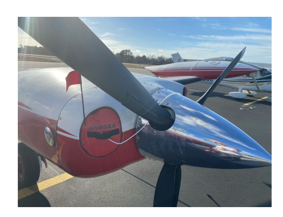
Cessna 401A Engine Inlet Plugs