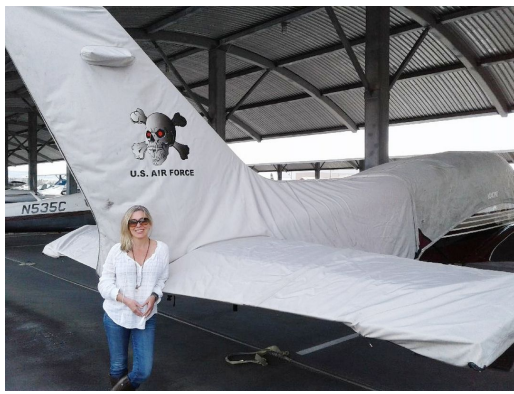
Cessna 310R Empennage Cover