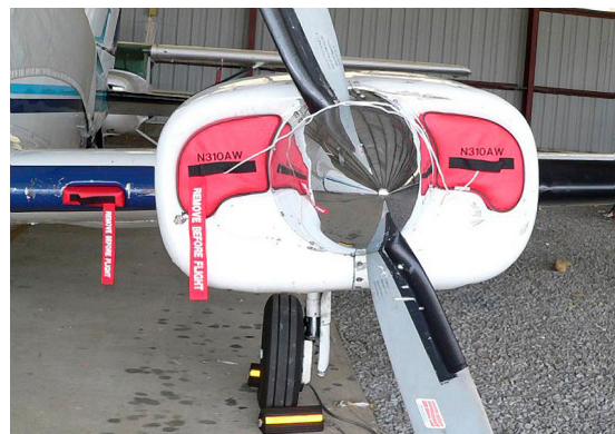
Cessna 310P Engine Inlet and Center Section Inlet Plugs