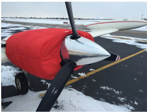
Cessna 310 Insulated Engine Cover