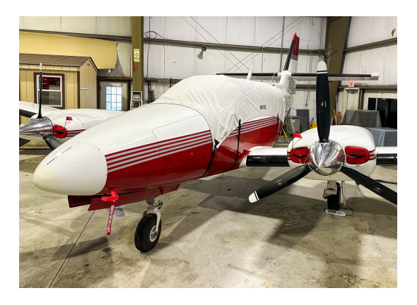
Cessna T303 Canopy Cover, Engine Plugs