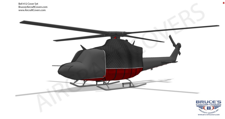
Bell 412 Forward Cabin/Nose, Insulated Engine, Tailboom, Rotor Hub & Blade Covers

available separately. Specific information for each model is available on request.