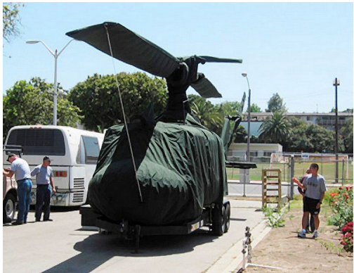
Bell 204/205 Full Body Cover Set