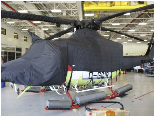
Bell 412 Cockpit/Canopy/Nose, Insulated Engine Area, Rotor Hub, Blade, Tailboom and Tail Rotor Covers