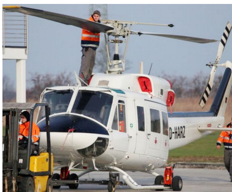
Bell 212 Main and Oil Cooler Intake Plugs

The Engine Inlet Plugs are custom fit for your Bell 212 intakes, made with heavy-duty vinyl material, and stuffed with a single block of sculpted urethane foam. Each plug has a zipper that allows the foam to be removed and dried if necessary. Engine plugs have 'Remove Before Flight' streamers sewn onto the face of the plugs. Most plugs are imprinted with the aircraft registration number in black for an extra charge. Storage bag NOT included. Engine plugs may be inserted after flight when the engine is still warm. Engine Inlet Plugs are commonly referred to as Cowl Plugs, Intake Plugs, Cowl Blocks, Engine Blocks, and Engine Bungs.