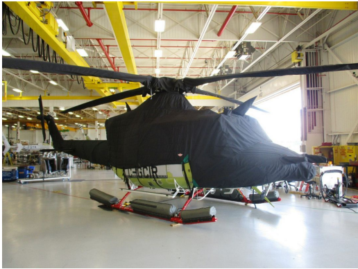
Bell 412 Cockpit/Canopy/Nose, Insulated Engine Area, Rotor Hub, Blade, Tailboom and Tail Rotor Covers

WINTER USE MATERIAL - Made with Solution-Dyed Polyester fabric, this option is intended for seasonal use to aid in deicing, rain mitigation, or for occasional travel. The material is lighter and more compact, but more susceptible to UV damage and may have a shorter useful life if used continuously outside than the all-year use material.