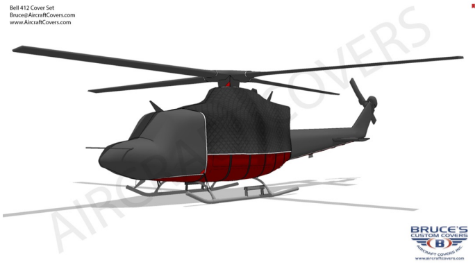
Bell 412 Forward Cabin/Nose, Insulated Engine, Tailboom, Rotor Hub & Blade Covers