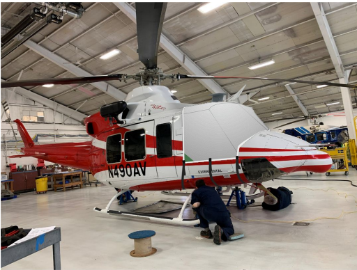
Bell 412 Cockpit/Canopy Cover, photo/illustration

This cover type is made from Silver Acrylic Sunbrella canvas and is 100% lined with a soft and smooth microfiber. Bruce's Custom Covers developed this material combination especially for aircraft protection. The outer material is medium weight and treated for water resistance, UV resistance and anti-static buildup. The inner lining is a very soft and smooth microfiber to prevent scratching. The material is very reflective, and tests show that the cabin interior temperature can be reduced to near-ambient temperature on the hottest of days. It is water, ice and snow repellent, yet breathable to allow moisture to escape from between the cover and the aircraft surface.