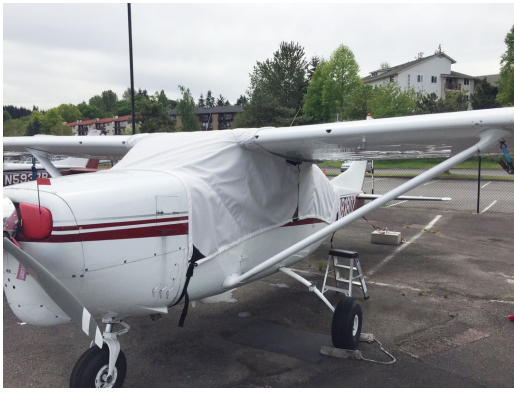
Cessna 205 Over-Top Canopy Cover