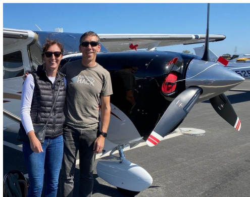
Cessna 206 Engine Inlet Plugs

be inserted after flight when the engine is still warm. Engine Inlet Plugs are commonly referred to as Cowl Plugs , Intake Plugs , Cowl Blocks , Engine Blocks , and Engine Bungs .