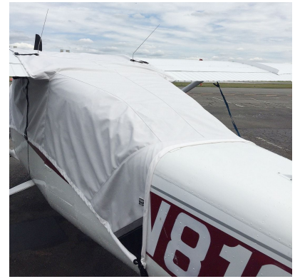
Cessna 205 Over-Top Canopy Cover