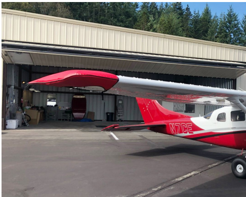
Cessna 206 Wingtip Pads

Designed to prevent damage to the aircraft extremities in crowded hangars, these products are made of bright red Naugahyde and thickly padded with a sandwich of closed cell foam.