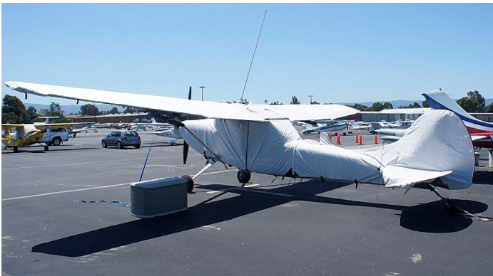
Wing Covers on Cessna Bird Dog

WINTER USE MATERIAL - Made with Solution-Dyed Polyester fabric, this option is intended for seasonal use to aid in deicing, rain mitigation, or for occasional travel. The material is lighter and more compact, but more susceptible to UV damage and may have a shorter useful life if used continuously outside than the all-year use material.