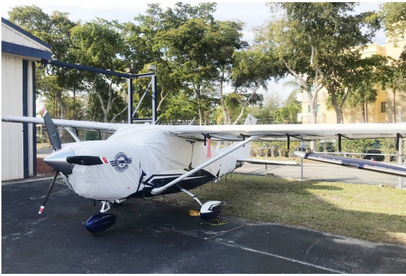
Cessna T206H Canopy, Engine, Wing & Empennage Covers