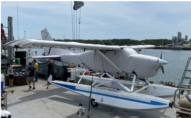
Cessna U206F Amphib Cover Set