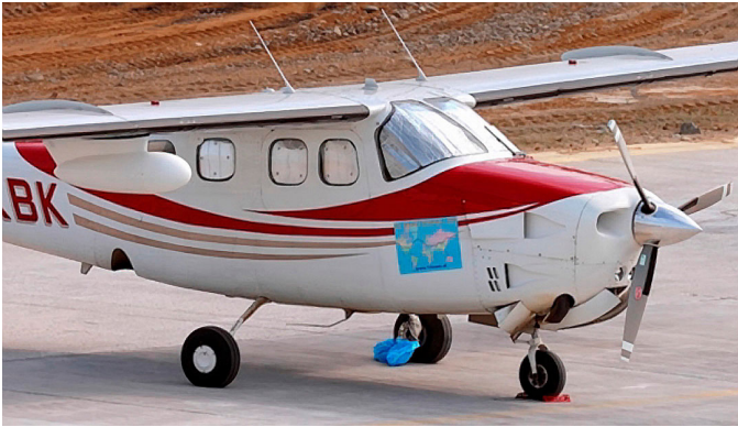
Cessna P210 HeatShield Set

Windshield Heatshields are interior sunshades for an aircraft's front windshield. The product is a unique composite of closed-cell foam with a silver mylar finish. The semi-rigid design is stiff enough to stand along the inside of the windshield using sun visors or window framing. It folds up flat and easily stores in the included storage sleeve. Some designs may require velcro and suction cups or split right and left sides. A Heatshield is an excellent short-term remedy for cockpit overheating. An external fabric cover is far more effective and practical for long-term protection.