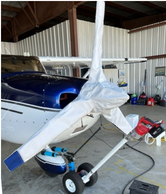
Cessna 182 Skylane 3-Blade Prop Cover

This cover type is made from Silver Acrylic Sunbrella canvas and is 100% lined with a soft and smooth microfiber. Bruce's Custom Covers developed this material combination especially for aircraft protection. The outer material is medium weight and treated for water resistance, UV resistance and anti-static buildup. The inner lining is a very soft and smooth microfiber to prevent scratching. The material is very reflective, and tests show that the cabin interior temperature can be reduced to near-ambient temperature on the hottest of days. It is water, ice and snow repellent, yet breathable to allow moisture to escape from between the cover and the aircraft surface.