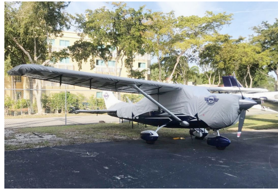
Cessna T206H Canopy, Engine, Wing & Empennage Covers