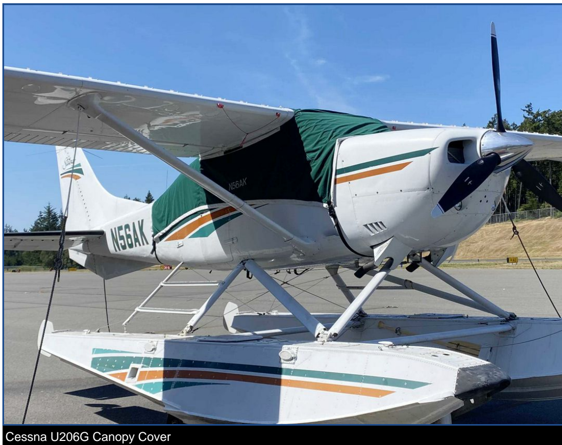
Cessna U206G Canopy Cover