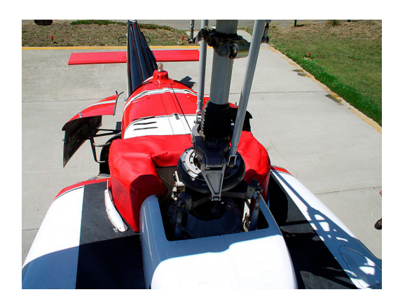
Bell 204 Particle Separator (intake) Cover