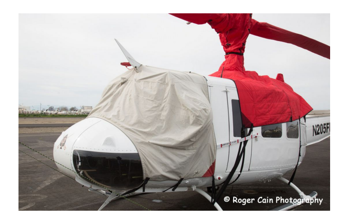
Bell 205 Engine, Rotor Mast, Blades & Forward Cabin Covers

WINTER USE MATERIAL - Made with Solution-Dyed Polyester fabric, this option is intended for seasonal use to aid in deicing, rain mitigation, or for occasional travel. The material is lighter and more compact, but more susceptible to UV damage and may have a shorter useful life if used continuously outside than the all-year use material.