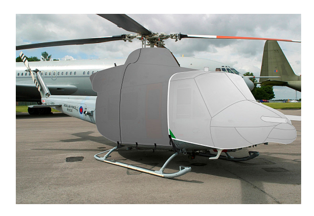
Forward Cabin Nose & Mid-Cabin/Engine Cover (extended to cross tubes)

The material is very reflective, and tests show that the cabin interior temperature can be reduced to near-ambient temperature on the hottest of days. It is water, ice and snow repellent, yet breathable to allow moisture to escape from between the cover and the aircraft surface.