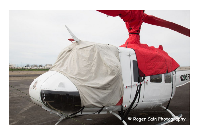
Bell 205 Engine, Rotor Mast, Blades & Forward Cabin Covers