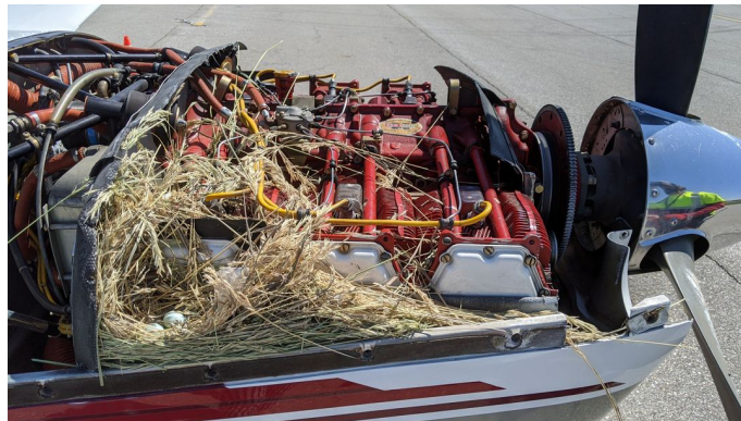
Engine and Oil Cooler Inlet Plugs ENGINE PLUGS PREVENT BIRD NEST FOD. Piper Saratoga Engine Cowling Bird's Nest