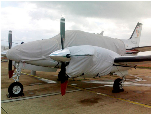
King Air C90 Canopy/Nose Cover, Engine Covers

The Beech 1900D Nose Cover is designed to cover the section of the fuselage forward of the windshield to the tip of the nose. It is secured with belly strapsThis cover type is made from Silver Acrylic Sunbrella canvas and is 100% lined with a soft and smooth microfiber. Bruce's Custom Covers developed this material combination especially for aircraft protection. The outer material is medium weight and treated for water resistance, UV resistance and anti-static buildup. The inner lining is a very soft and smooth microfiber to prevent scratching. The material is very reflective, and tests show that the cabin interior temperature can be reduced to near-ambient temperature on the hottest of days. It is water, ice and snow repellent, yet breathable to allow moisture to escape from between the cover and the aircraft surface.