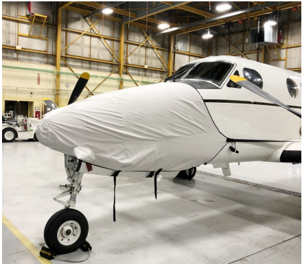
King Air 200 Nose Cover