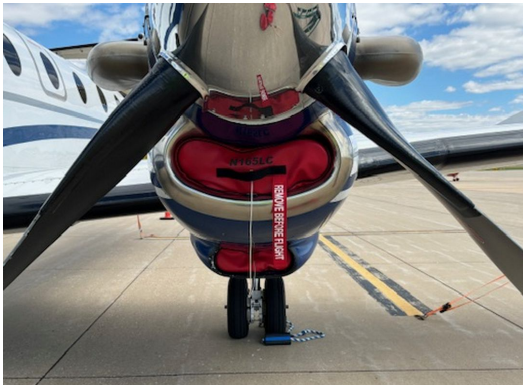
Beech 1900C ENGINE INLET PLUGS & OIL COOLER PLUGS

Engine Inlet Plugs are custom fit for your Beech 1900C intakes, made with heavy-duty vinyl material, and stuffed with a single block of sculpted urethane foam. Each plug has a zipper that allows the foam to be removed and dried if necessary. Engine plugs have warning flags that are visible from the cockpit or 'remove before flight' streamers sewn onto the face of the plugs. Most plugs are imprinted with the aircraft registration number in black for an extra charge. Storage bag NOT included. Engine plugs may be inserted after flight when the engine is still warm. Engine Inlet Plugs are commonly referred to as Cowl Plugs, Intake Plugs, Cowl Blocks, Engine Blocks, and Engine Bung. s.