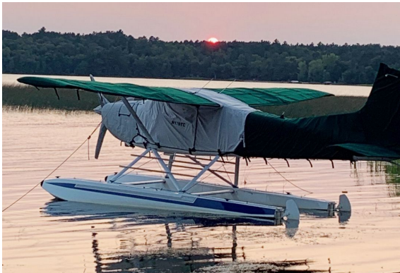
Cessna A185F Complete Cover Set