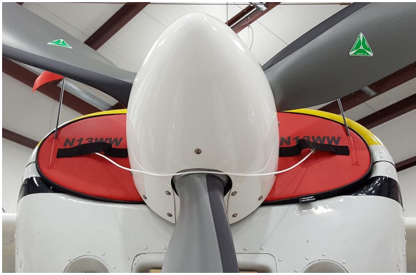
Cessna 185F Engine Plugs