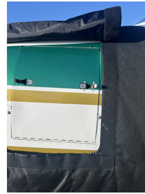
Cessna 180B Insulated Engine Cover, Fully Enclosed