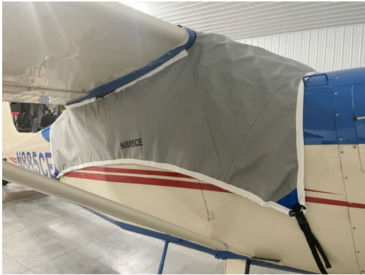
Cessna 180 Travel Weight Canopy Cover