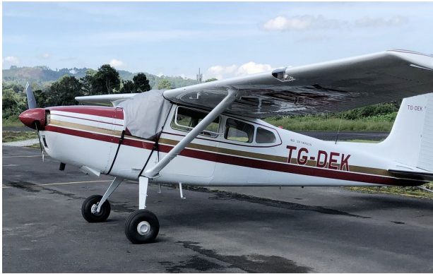
Cessna 180 Windshield Cover

The material is very reflective, and tests show that the cabin interior temperature can be reduced to near-ambient temperature on the hottest of days. It is water, ice and snow repellent, yet breathable to allow moisture to escape from between the cover and the aircraft surface.