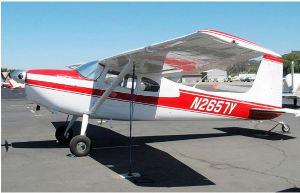
Cessna 180 & 185 Windshield HeatShield