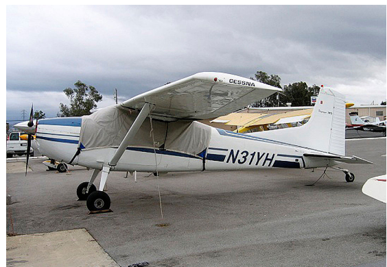
Cessna 185 Standard Canopy Cover