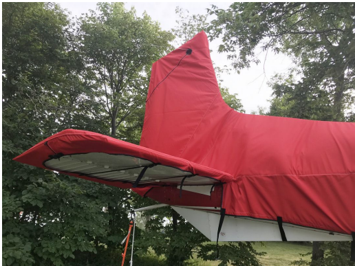
Cessna 185 Empennage Cover

WINTER USE MATERIAL - Made with Solution-Dyed Polyester fabric, this option is intended for seasonal use to aid in deicing, rain mitigation, or for occasional travel. The material is lighter and more compact, but more susceptible to UV damage and may have a shorter useful life if used continuously outside than the all-year use material.