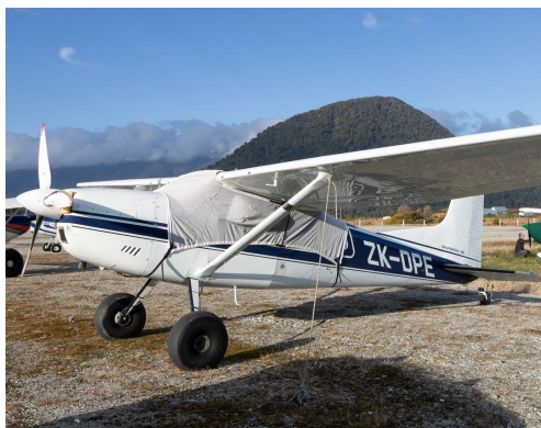
Cessna 185 Light Weight Travel Canopy Cover

This cover type is made from Silver Acrylic Sunbrella canvas and is 100% lined with a soft and smooth microfiber. Bruce's Custom Covers developed this material combination especially for aircraft protection. The outer material is medium weight and treated for water resistance, UV resistance and anti-static buildup. The inner lining is a very soft and smooth microfiber to prevent scratching. The material is very reflective, and tests show that the cabin interior temperature can be reduced to near-ambient temperature on the hottest of days. It is water, ice and snow repellent, yet breathable to allow moisture to escape from between the cover and the aircraft surface.