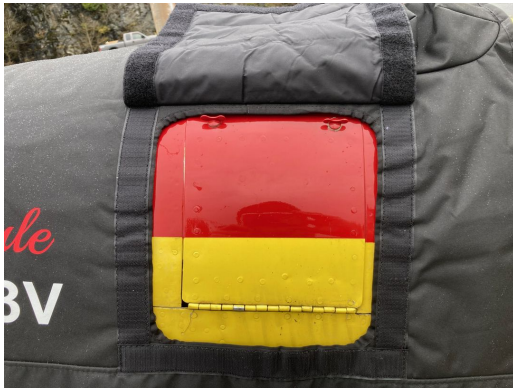
Cessna 180H Insulated Engine Cover