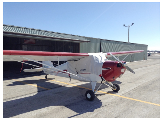
Aeronca Chief Canopy Cover