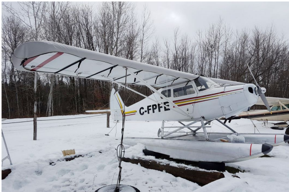
Christavia Mk 1 Wing Covers