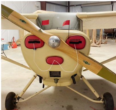
Aeronca 11AC Chief Engine Plugs

Engine Inlet Plugs are custom fit for your Aeronca Chief 11AC, Super Chief 11CC intakes, made with heavy-duty vinyl material, and stuffed with a single block of sculpted urethane foam. Each plug has a zipper that allows the foam to be removed and dried if necessary. Engine plugs have warning flags that are visible from the cockpit or 'remove before flight' streamers sewn onto the face of the plugs. Most plugs are imprinted with the aircraft registration number in black for an extra charge. Storage bag NOT included. Engine plugs may be inserted after flight when the engine is still warm. Engine Inlet Plugs are commonly referred to as Cowl Plugs, Intake Plugs, Cowl Blocks, Engine Blocks, and Engine Bungs.