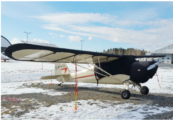
Aeronca Chief 11AC Canopy, Insulated Engine, & Wing Covers

This cover type is made from Silver Acrylic Sunbrella canvas and is 100% lined with a soft and smooth microfiber. Bruce's Custom Covers developed this material combination especially for aircraft protection. The outer material is medium weight and treated for water resistance, UV resistance and anti-static buildup. The inner lining is a very soft and smooth microfiber to prevent scratching. The material is very reflective, and tests show that the cabin interior temperature can be reduced to near-ambient temperature on the hottest of days. It is water, ice and snow repellent, yet breathable to allow moisture to escape from between the cover and the aircraft surface.