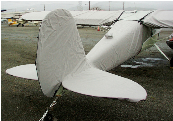
Cessna 120 Empennage Cover

WINTER USE MATERIAL - Made with Solution-Dyed Polyester fabric, this option is intended for seasonal use to aid in deicing, rain mitigation, or for occasional travel. The material is lighter and more compact, but more susceptible to UV damage and may have a shorter useful life if used continuously outside than the all-year use material.