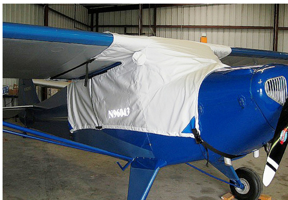
Taylorcraft BC12-D Over-the-top Canopy Cover

This cover type is made from Silver Acrylic Sunbrella canvas and is 100% lined with a soft and smooth microfiber. Bruce's Custom Covers developed this material combination especially for aircraft protection. The outer material is medium weight and treated for water resistance, UV resistance and anti-static buildup. The inner lining is a very soft and smooth microfiber to prevent scratching. The material is very reflective, and tests show that the cabin interior temperature can be reduced to near-ambient temperature on the hottest of days. It is water, ice and snow repellent, yet breathable to allow moisture to escape from between the cover and the aircraft surface.