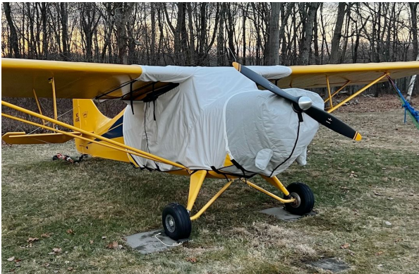
Aeronca Chief 11AC, Super Chief 11CC Insulated Engine Cover

This cover type is made from Silver Acrylic Sunbrella canvas and is 100% lined with a soft and smooth microfiber. Bruce's Custom Covers developed this material combination especially for aircraft protection. The outer material is medium weight and treated for water resistance, UV resistance and anti-static buildup. The inner lining is a very soft and smooth microfiber to prevent scratching. The material is very reflective, and tests show that the cabin interior temperature can be reduced to near-ambient temperature on the hottest of days. It is water, ice and snow repellent, yet breathable to allow moisture to escape from between the cover and the aircraft surface.