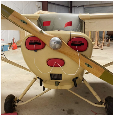
Aeronca 11AC Engine Inlet Plugs