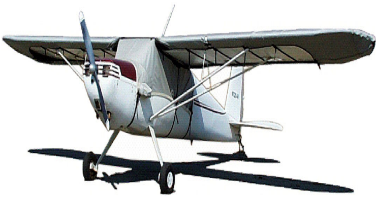
Cessna 120 Canopy Cover & Wing Covers