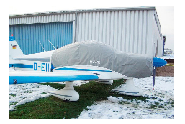
Robin R.2160 Canopy/Engine Cover

the hottest of days. It is water, ice and snow repellent, yet breathable to allow moisture to escape from between the cover and the aircraft surface.