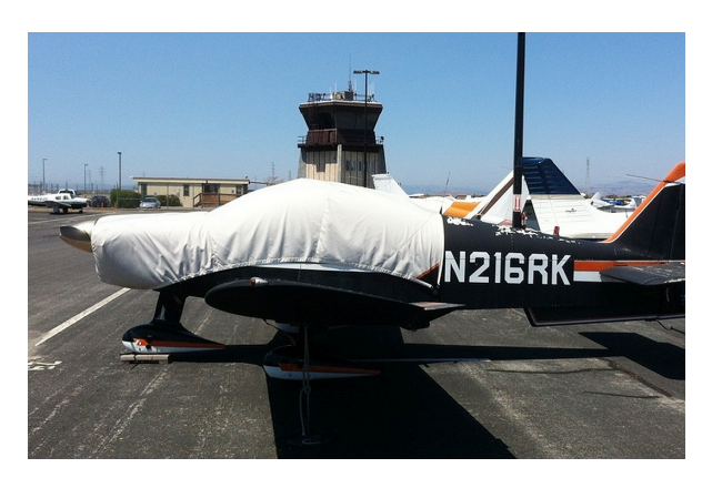
Robin Canopy/Engine Cover