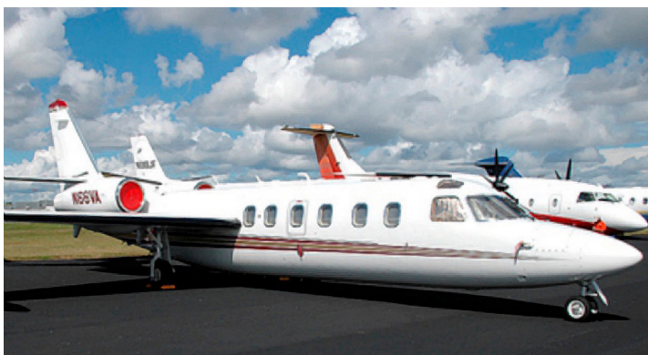
Westwind Engine Intake Plugs